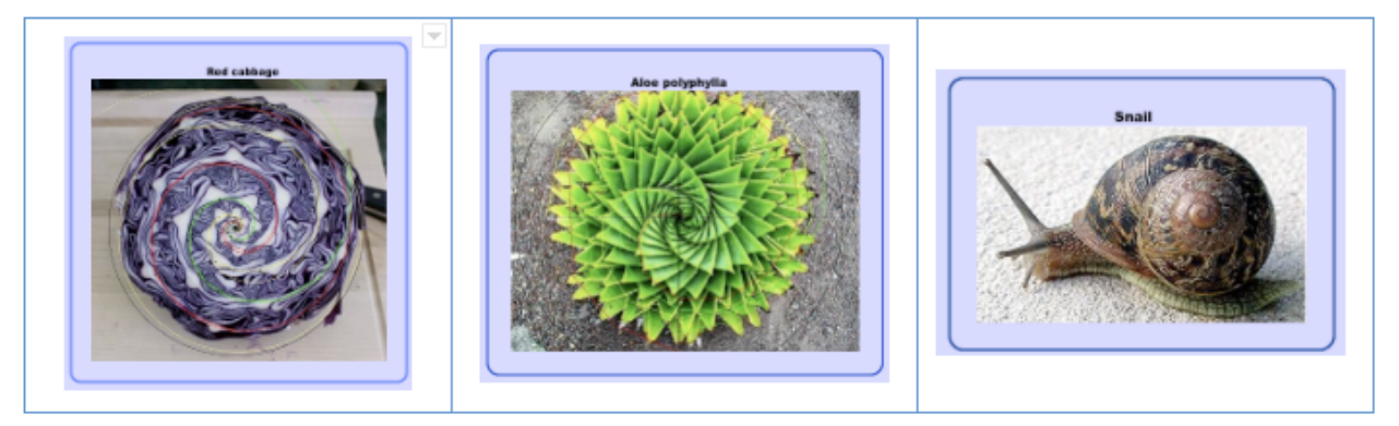
Fig. 1: DGS widgets enabling user to upload their own spiral pictures and try out some formulae that fit them.